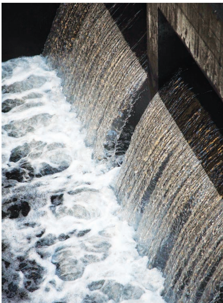
Fig.3 Decanting basin outlet