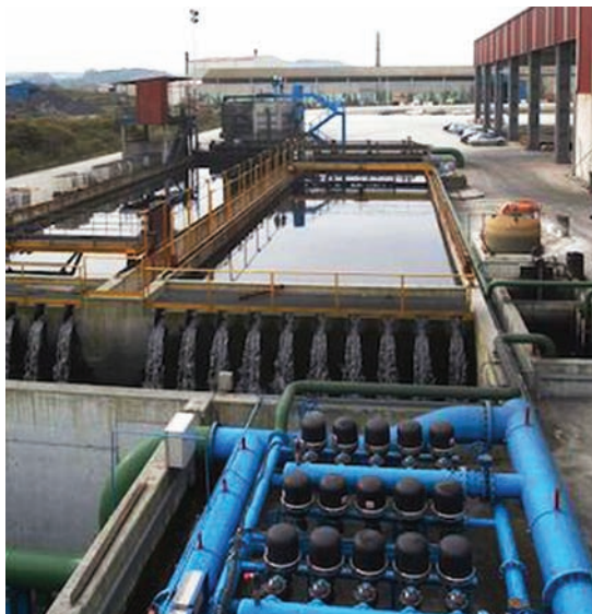
Fig.1 WTP at Siderúrgica Añón