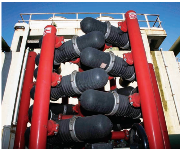
Fig.4 Ring filters

Scale pit The scale pit is normally installed below ground level because the water that drags the scale, oil and grease from the rolling mill process goes into the mill flume below the foundations. Once the polluted water enters the scale pit, the larger scale particles fall to the bottom where they are removed by a clamshell bucket bi-valve ladle and deposited in an area or container to dry. At Siderúrgica Añon, the scale water concentration enters the scale pit at 315mg/litre and exits at 120mg/litre. The water containing fine scale, oil and grease then passes to a basin and is subsequently pumped to the decanting basin.